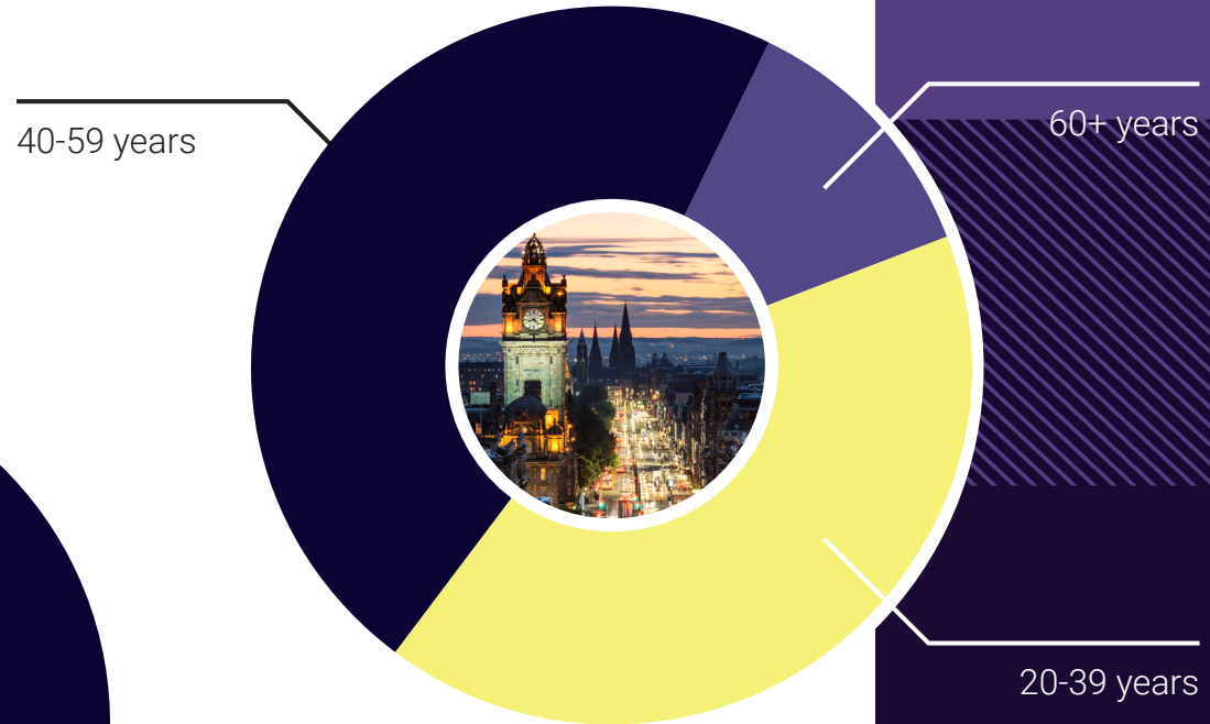
By age group